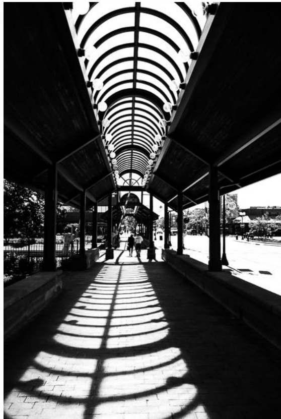
Highland Park Gateway - Cherner