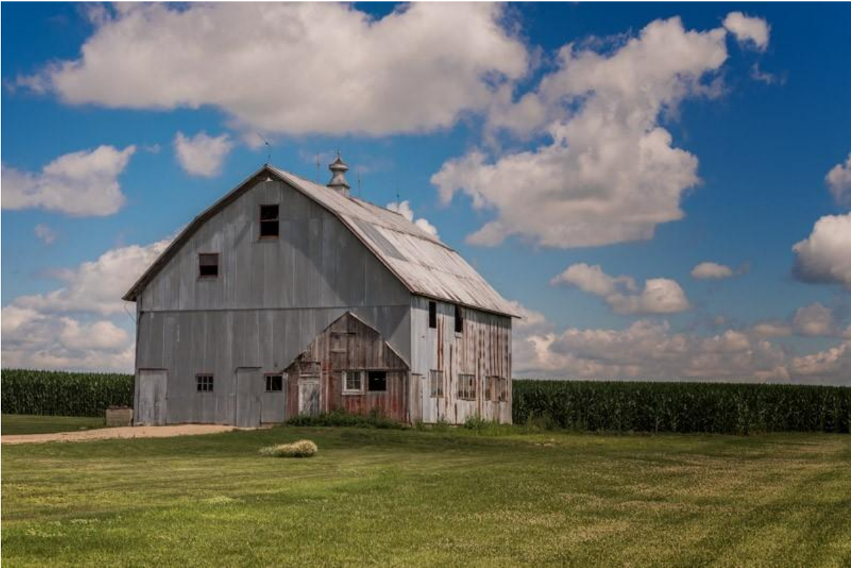
Barn #1- Marty Behn from the Barn outing on July 8