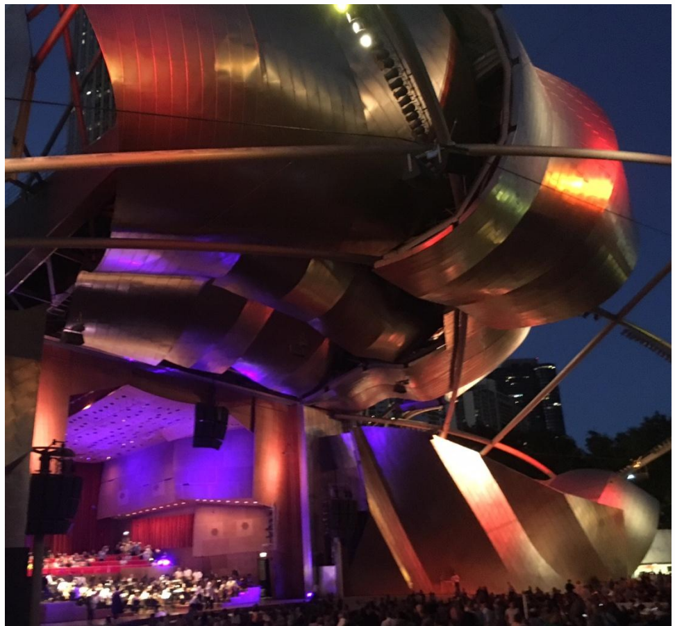
Pritzker Pavilion