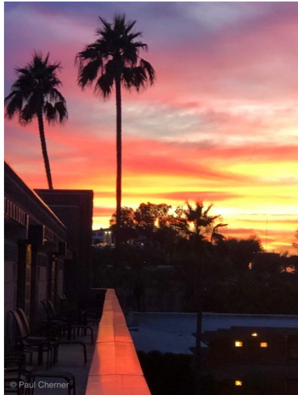
Paul Cherner - Phoenix sunset