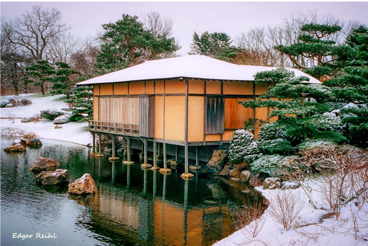
Edgar Reihl - Japanese Garden 1