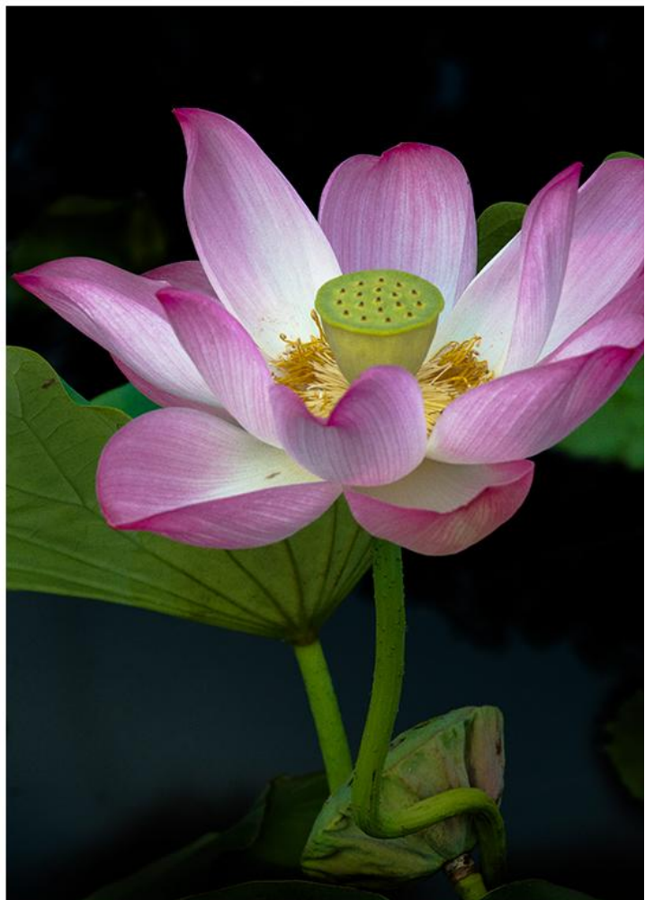
Lotus - Stan Kirschner