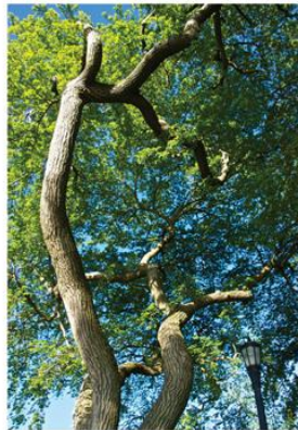
Old Age Splendor #1

Majestic Trees, Flowers, and Imagination