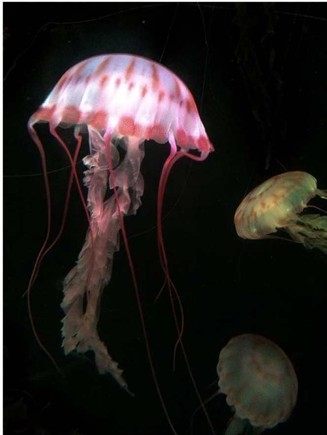
Jellies - Stan Kirschner