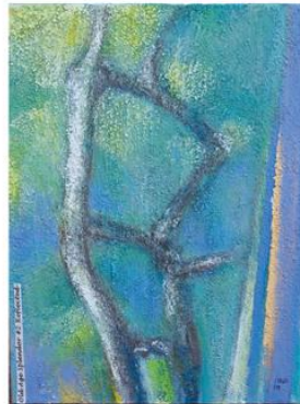
Old Age Splendor #2