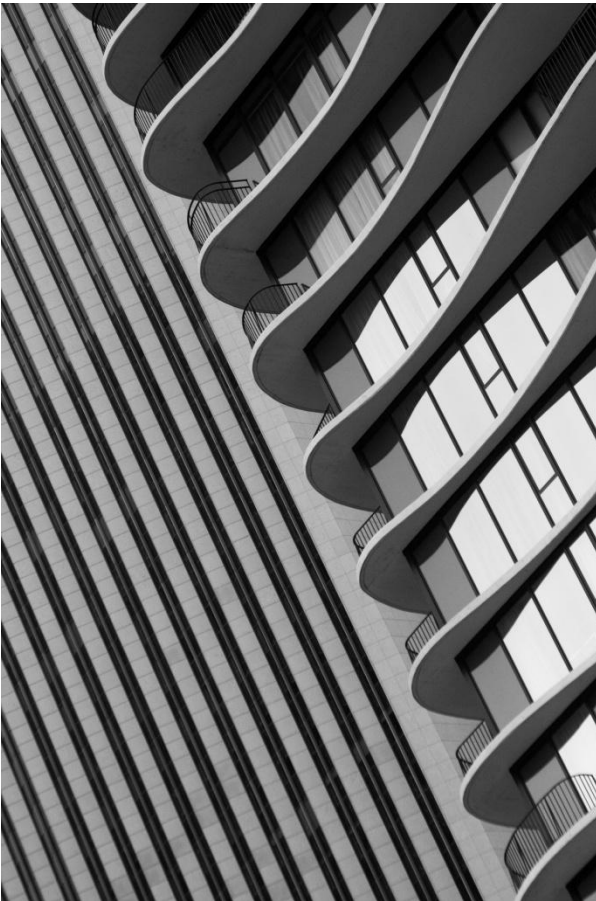
Jill Dorfman - Aqua Building